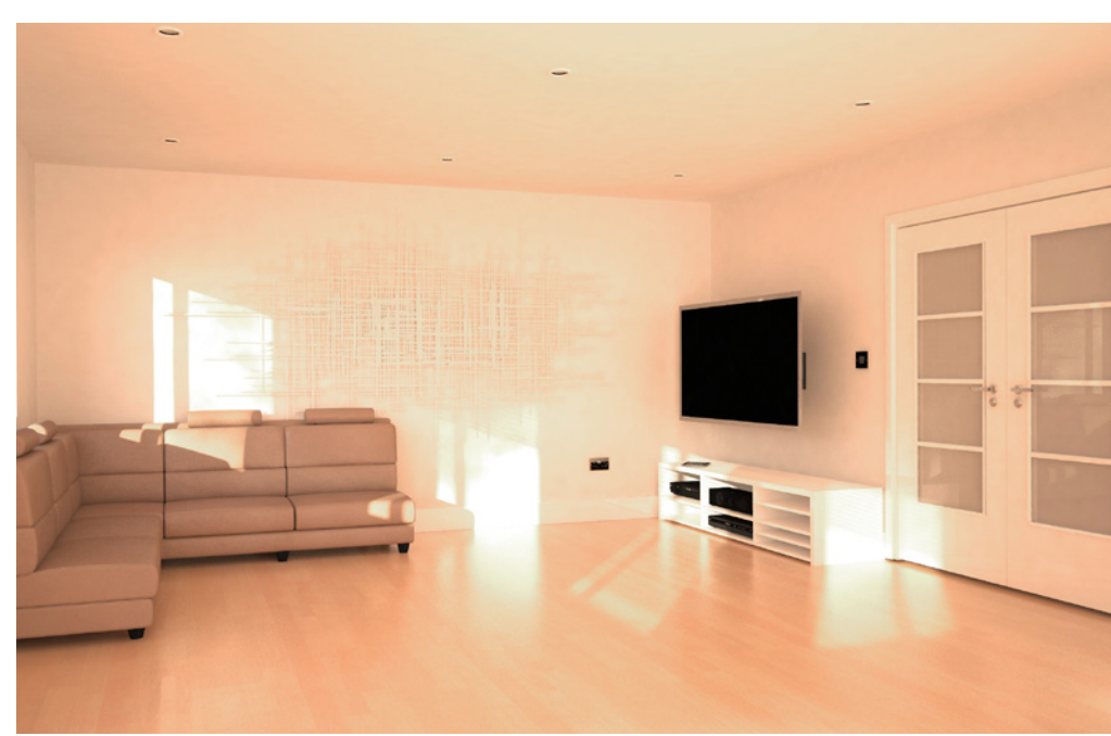
Living area Bathroom